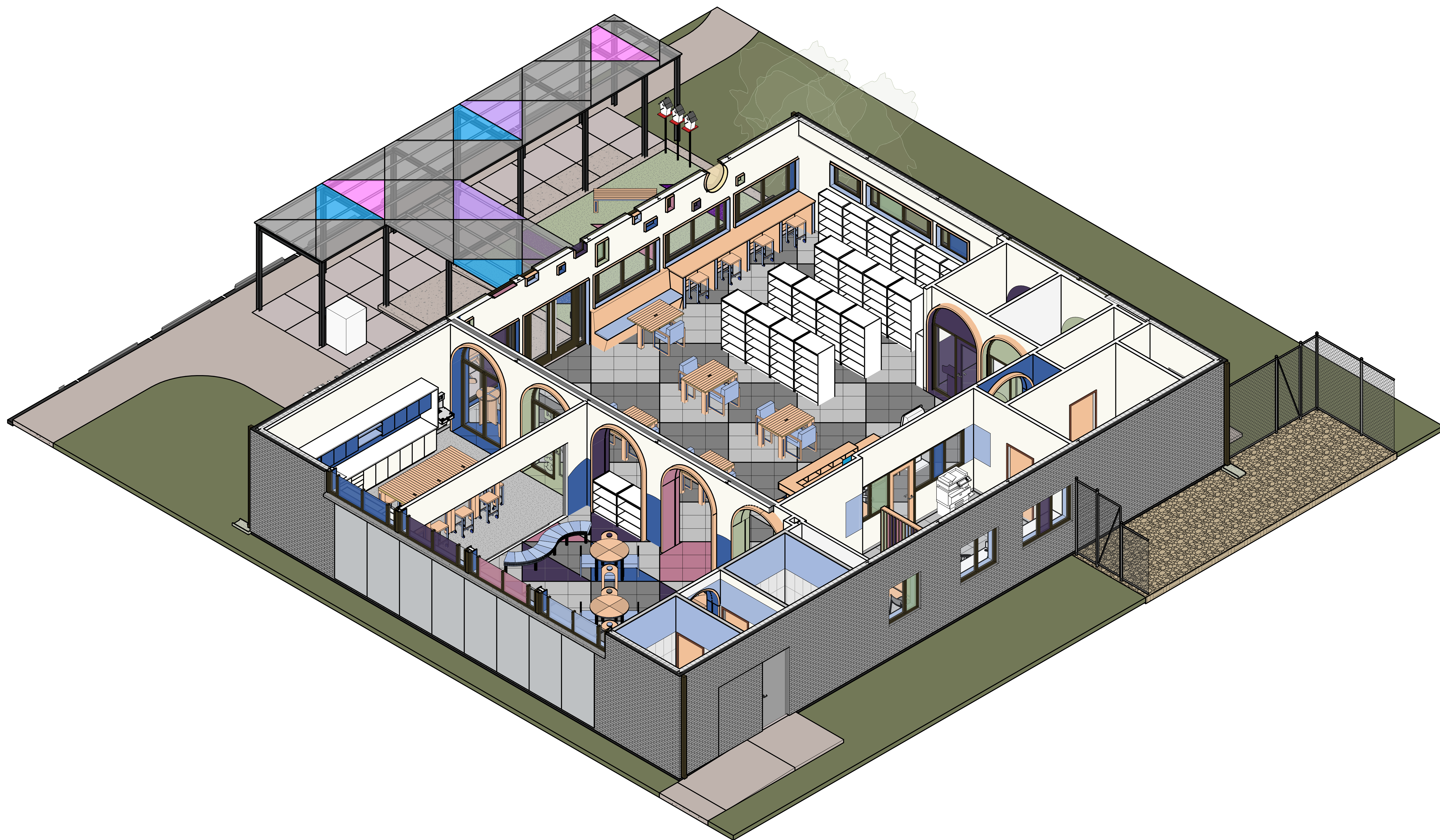
1 AR102 AXONOMETRIC PLAN LOOKING SOUTH

ARCHITECT Cas Architecture 183 N Perry St Lawrenceville, GA 30046 404 806 0556 www.casarc.com