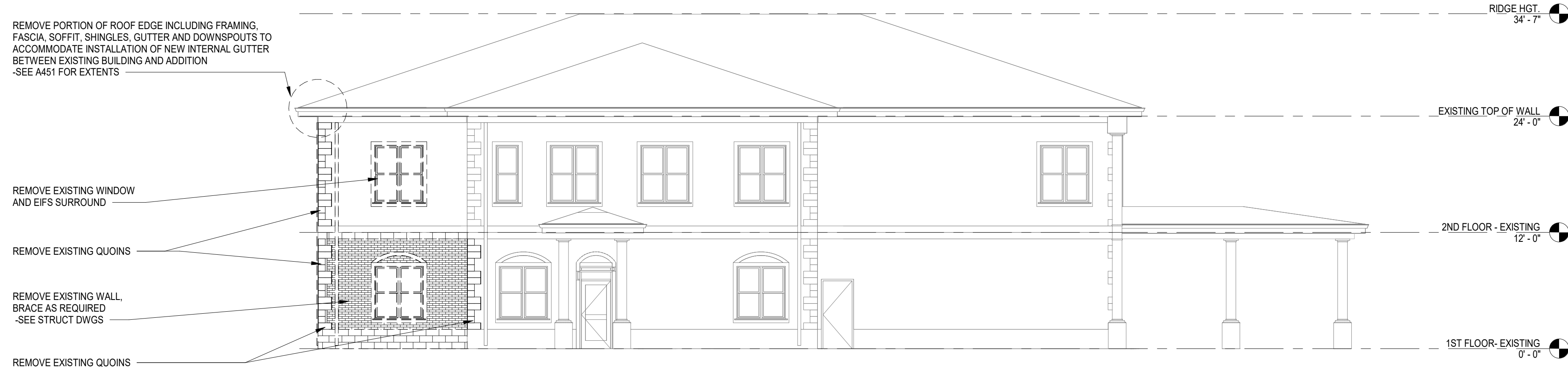
2 DEMO - SOUTH SCALE: 1/8" = 1'-0"