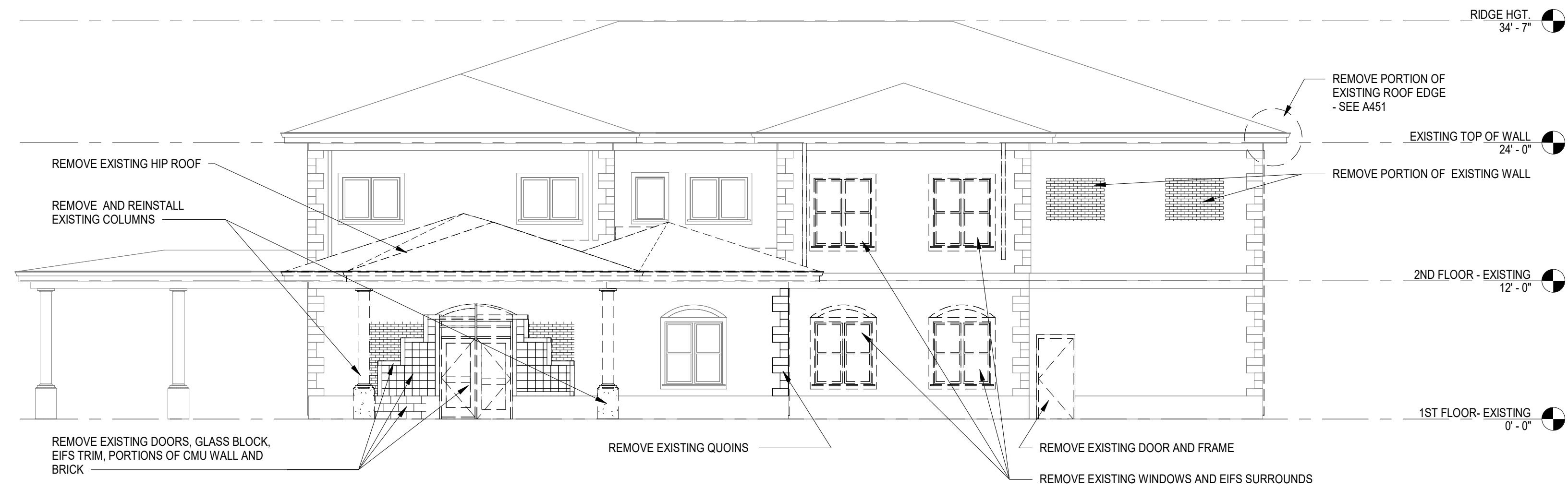
1 DEMO - NORTH SCALE: 1/8" = 1'-0"